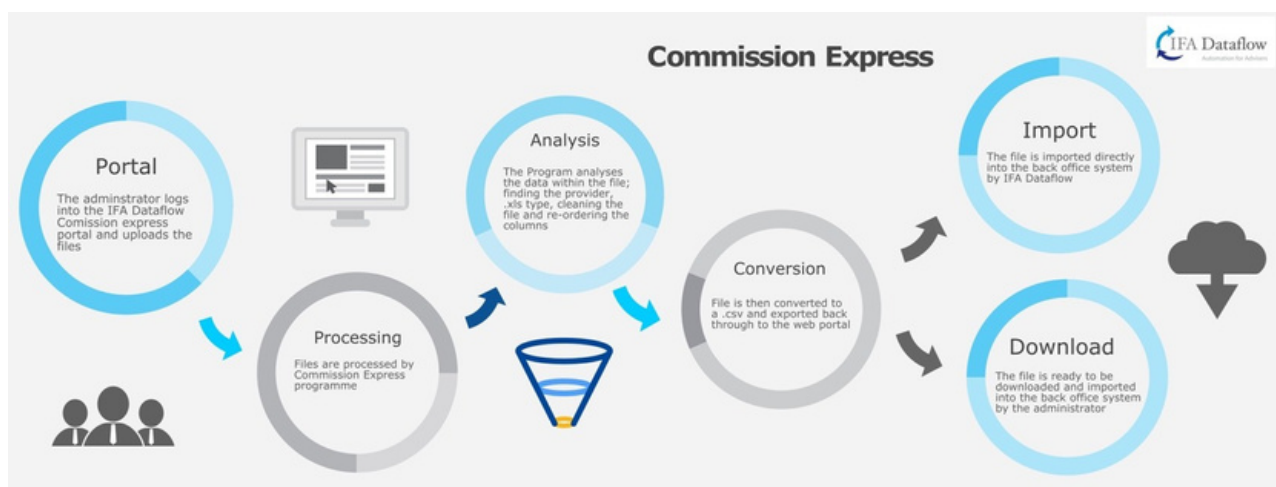
The 5-Step Process

Step 5: The file is automatically imported into the back office system or downloaded and imported by the back office system administrator.